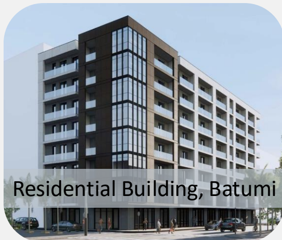
Residential Building, Batumi