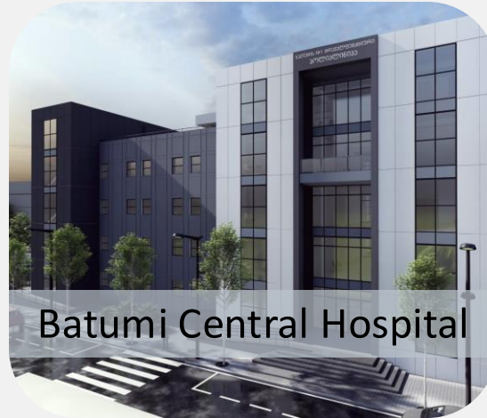
Batumi Central Hospital