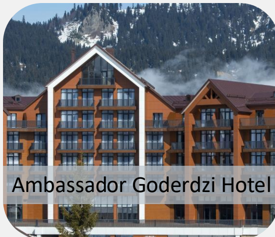
Ambassador Goderdzi Hotel