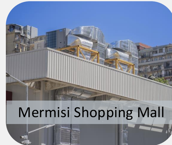
Mermisi Shopping Mall