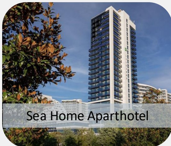
Sea Home Aparthotel