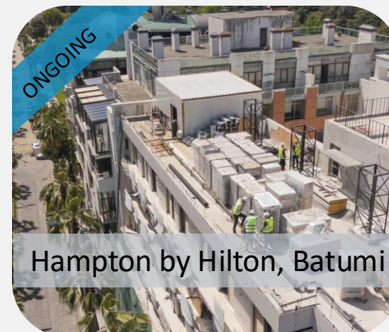
Hampton by Hilton, Batumi