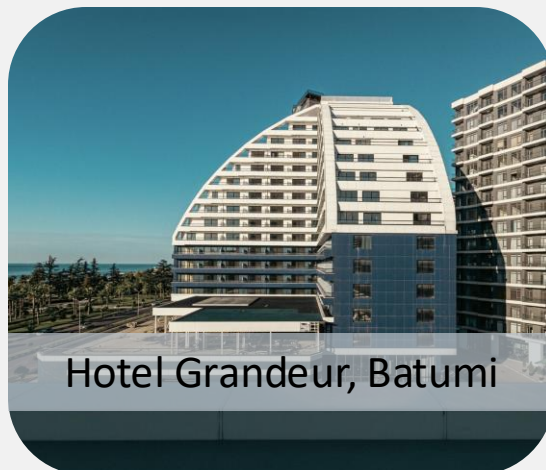
Hotel Grandeur, Batumi